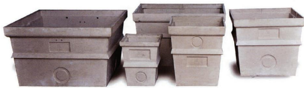
POLYMER CONCRETE PITS