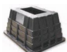
Railway Single Signal Base