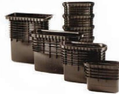
PITS P1PIT to P4PIT