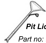
Pit Lid Lifter