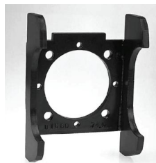
Fixed Rail Template