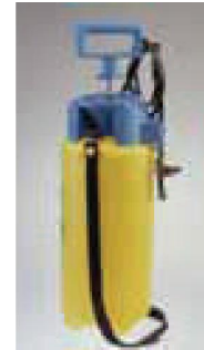
Coolant tank with pump

A wide range of accessories are available: such as clamping units, drill cutters, along with rail profile and special application templates.