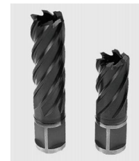
19 & 22mm Drills