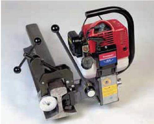
SBM-VS Rail Drill (715685)