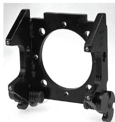
Universal rail Template 716202