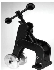
Rail Clamp BSK1 Over Rail (715360)

* Now also available is a 4-stroke & Electrical rail drill *