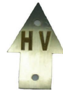
Q51-HV 85mm x 50mm HV Arrow