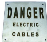
Q50 150mm x 150mm Warning Plate