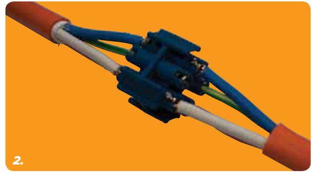
Connect wires with pillar terminals of terminal block or with junction terminals.