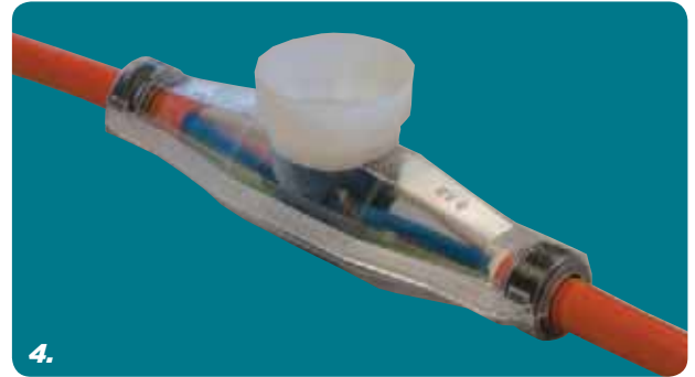
Place filler funnel on the filler-hole.