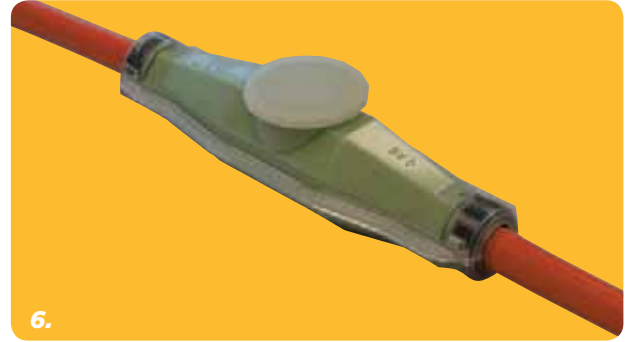
Cover the filler funnel with closing plug.