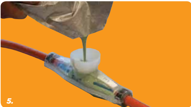
Cast the cable joint according to casting instructions.