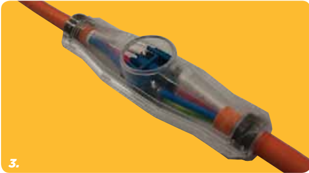
Put the lower joint sleeve symmetrically under the cable junction. Place the upper joint sleeve on the lower joint sleeve and close by snapping.