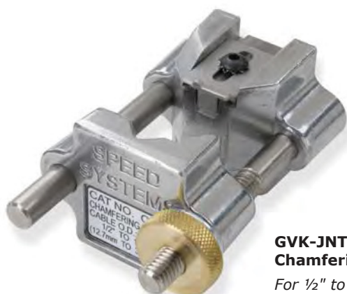
GVK-JNTR-XLPECT Chamfering Tool

The 2689 Chamfering Tool/Scale Gauge fits the 1542 Series Strippers to provide both scale gauge and chamfering capabilities.