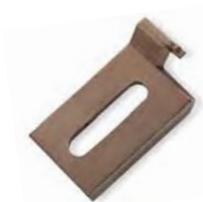
GVK-JNTR-XLPCTB Replacement Blade

GVK-JNTR-XLPCTB Chamfering Blade is used in the GVK-JNTR-XLPECT to cut a small bevel on the edge of the insulation to ease insertion into molded rubber components.