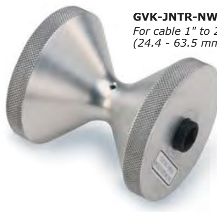
GVK-JNTR-NWSML For cable 1" to 2-1/2" O.D. (24.4 - 63.5 mm)