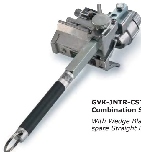
GVK-JNTR-CSTRP Combination Stripper With Wedge Blade installed, spare Straight Blade