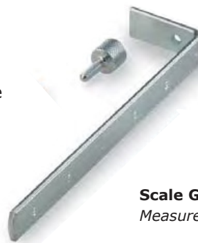
Scale Gauge Measures stripback