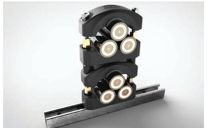
Double stacked trefoil application