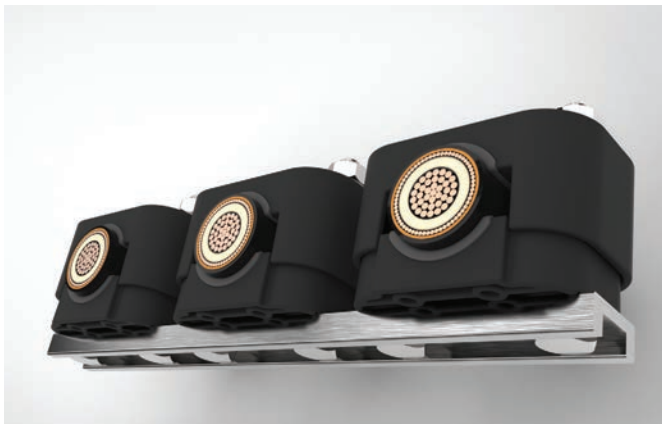
3 Phase pad mount kit TAP10910 - Ø 26-38mm