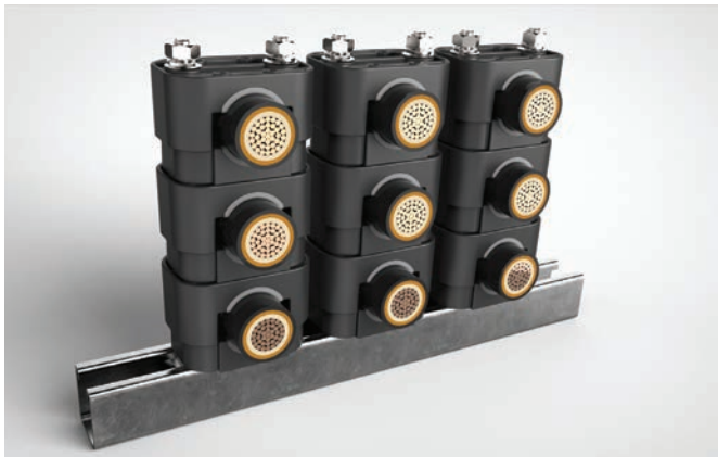
3 x 3 configuration