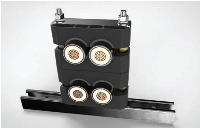
Stacked dual application

Stacking is possible for Single and Trefoil cable clamps, furthermore, TE Connectivity's in house design team is on hand to produce tailor made schematics and specify technical details for custom cable clamp layouts that suit your specific needs. Please contact your local TE Connectivity Energy Representative for more details.